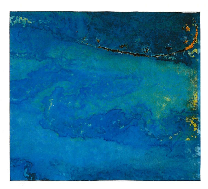
Pleiades - Martina Stuflesser