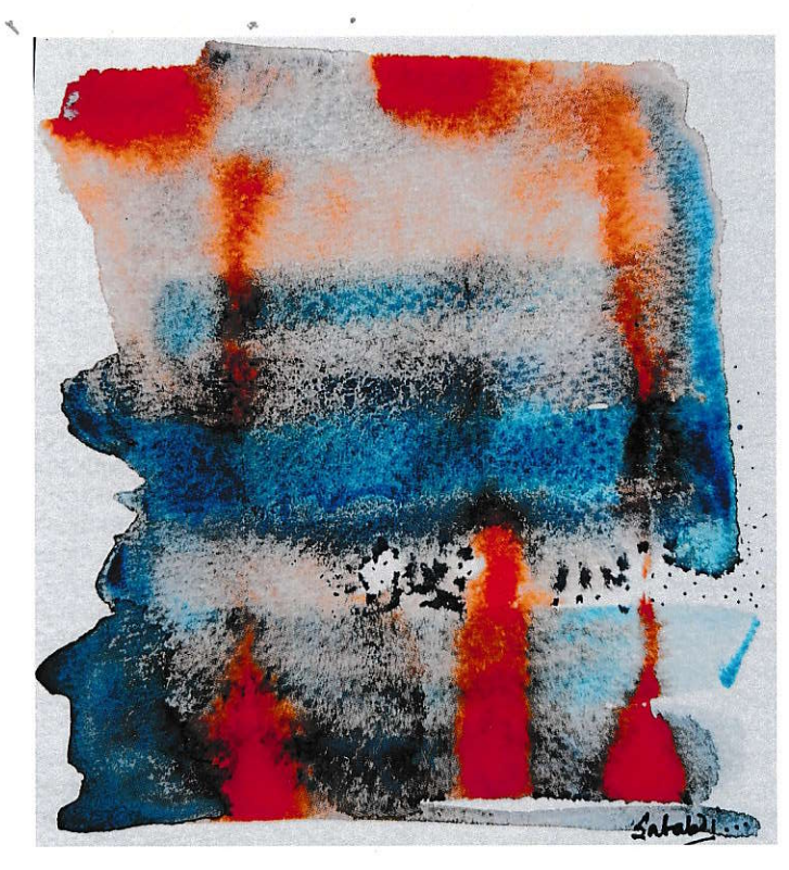
Cassiopeia - Satabdi Hati